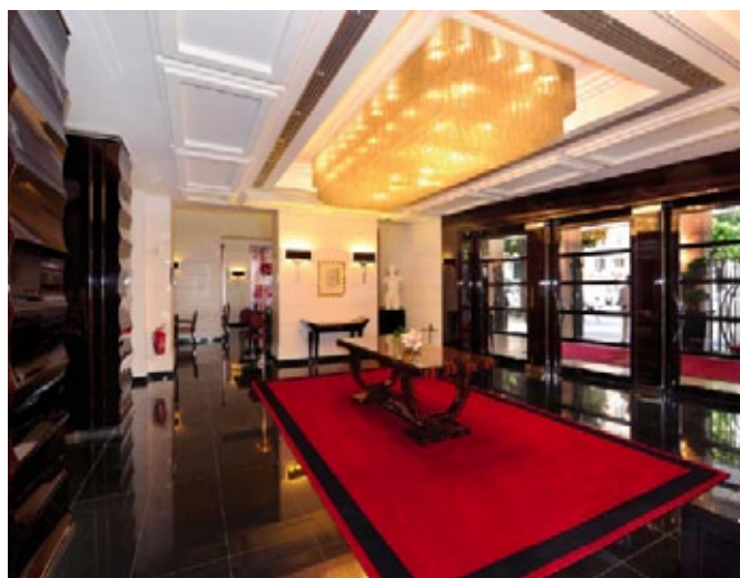
5* Hotel, Rome, Italy