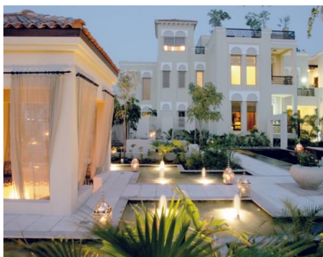
Al Barari Villas, Nad Al Sheba, Dubai