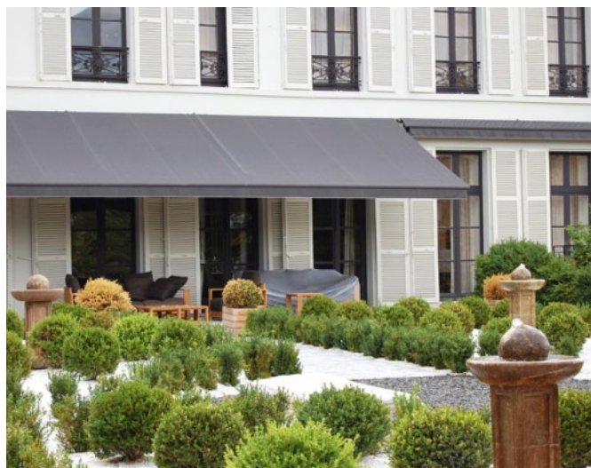
Chateau near Paris, France