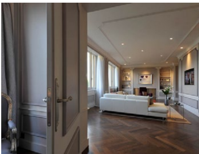
Du Parc Kempinski Private Residences, Switzerland