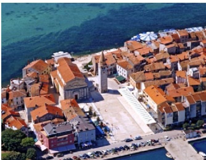
5* Resort Hotel, Itsria Coast, Croatia