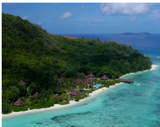
Land on Praslin Island, Seychelles