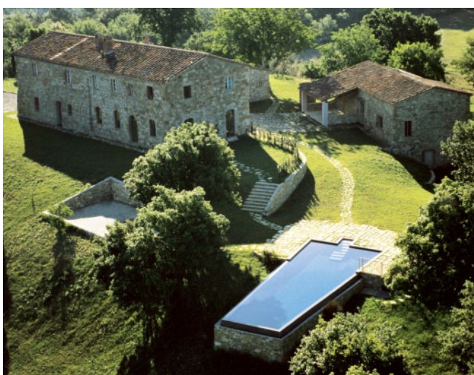
Castello di Casole Villas, Tuscany, Italy