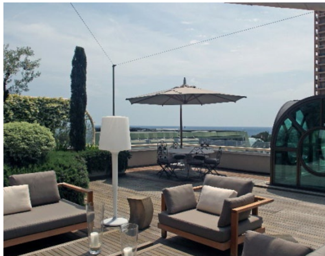
Le 21 Avenue Princesse Grace, Monte-Carlo, Monaco