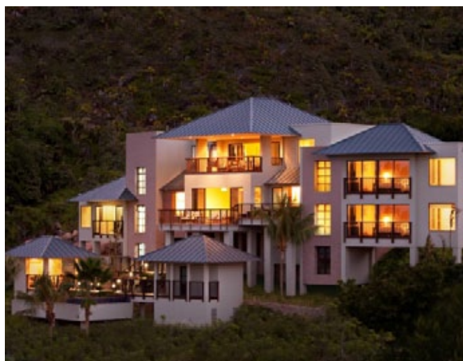
Raffles Estates, Praslin Island, Seychelles