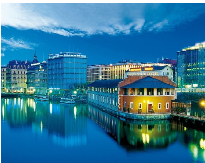
Commercial Building in Geneva, Switzerland