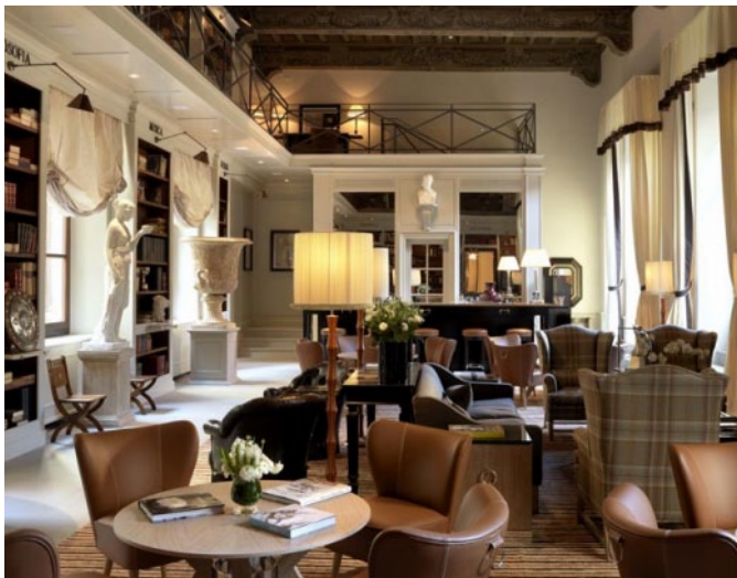
Palazzo Tornabouni Private Residence Club, Florence, Italy